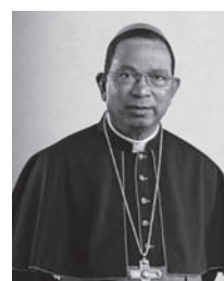
Cardinal Telesphore Placidus Toppo Archbishop of Ranchi (India)