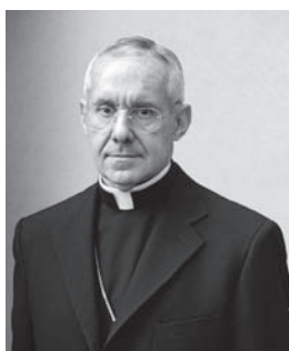
Cardinal Jean-Louis Tauran