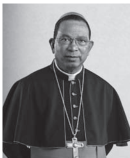
Cardinal Telesphore Placidus Toppo