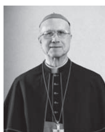
Cardinal Tarcisio Bertone S.D.B., Secretary of State (President of the Commission)

Cardinals' Commission , appointed by Papal Decree for a period of five years.