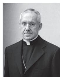
Cardinal Jean-Louis Tauran President of the Pontifical Council for Interreligious Dialogue