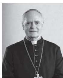
Cardinal Odilo Pedro Scherer Archbishop of Sao Paulo (Brazil)