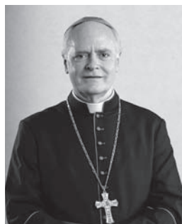
Cardinal Odilo Pedro Scherer